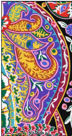
BORDER 2 57 X 42