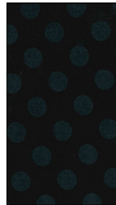
BORDER & BINDING 40 X 42