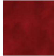
SHUTTERS/ DOORS 8 X 8