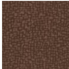
SIDEWALK 6 X 4