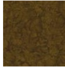
ROOF 6 X 10.5