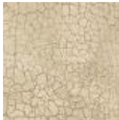
CHIMNEY 13 X 7