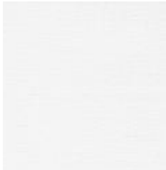
WINDOWS 6 X 48