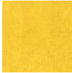
HOUSE SIDE 11 X 4