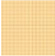
HOUSE FRONT 10 X 7