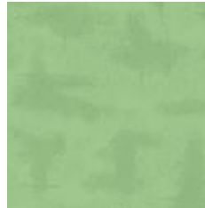
Pennant On Boat 4 x 4