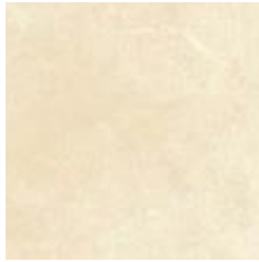
Background 12 X 21