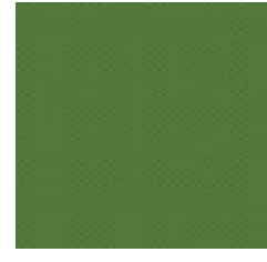
Hill 12 X 8