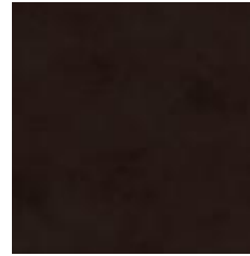
Boat Mast 2 X 10.5