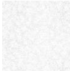
Angel Wings 6 X 4