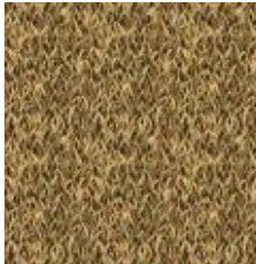
Chimney 3 X 10.5