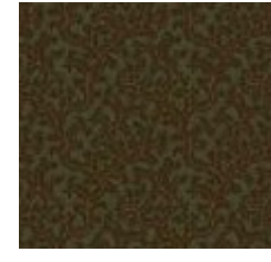
House 6 X 10.5