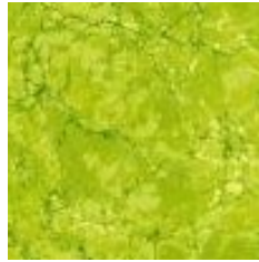
Trees/Shrubs 10 X 10.5