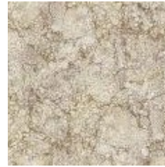
Sidewalk 8 X 4