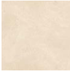
BG 28 X 10.5