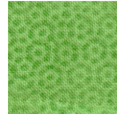
TREE - LT. GREEN