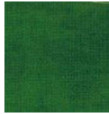
GRASS - GREEN