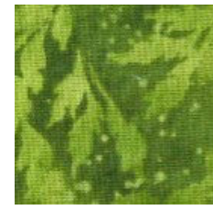
TREE - GREEN SPARKLE