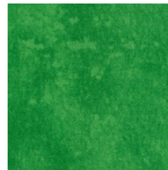
MEDIUM GRASS 14X14