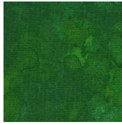
MEDIUM TONAL TREE REAR TREE 7X14