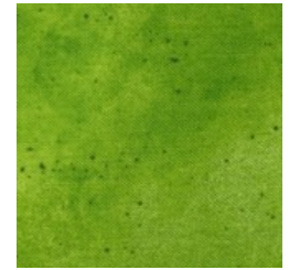
SPARKLE TREE FRONT TREE 10X10