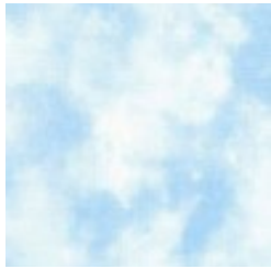
SKY 10 X 21