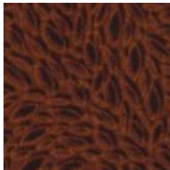
TREE TRUNKS 3 X 4