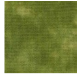
FRONT TREE 9 X 14