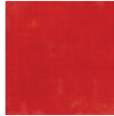
Door 7 X 7