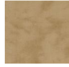
Porch 5 X 21