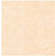
Store 10 x 10.5