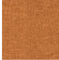
Window Shades 6 X 7