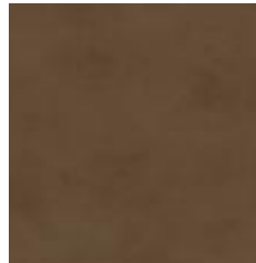
Porch Riser 4 X 7