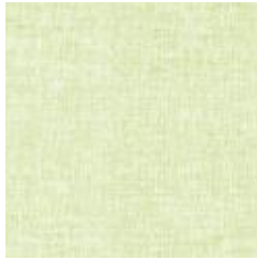
Sage Grass 9 X 21