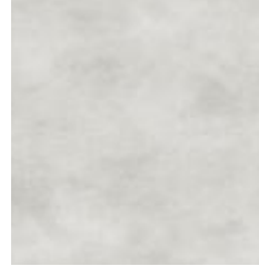
Windows 7 X 7