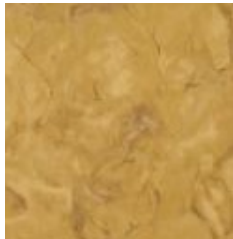
Porch Underpins 9 X 5