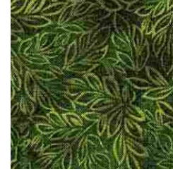
MEDIUM GRASS 14X14