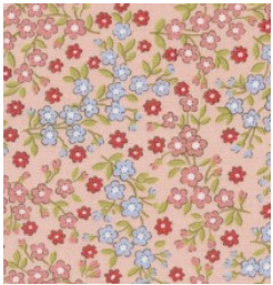
WINDOWS 5 X 7