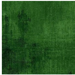
REAR TREE 14X4