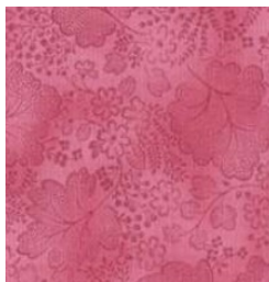
COTTAGE TRIM 8 X 10.5