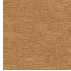
TREE TRUNKS 4X4