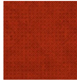
DOOR 7 X 5