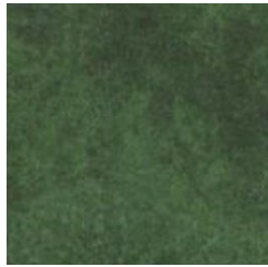
FRONT TREE 12X6