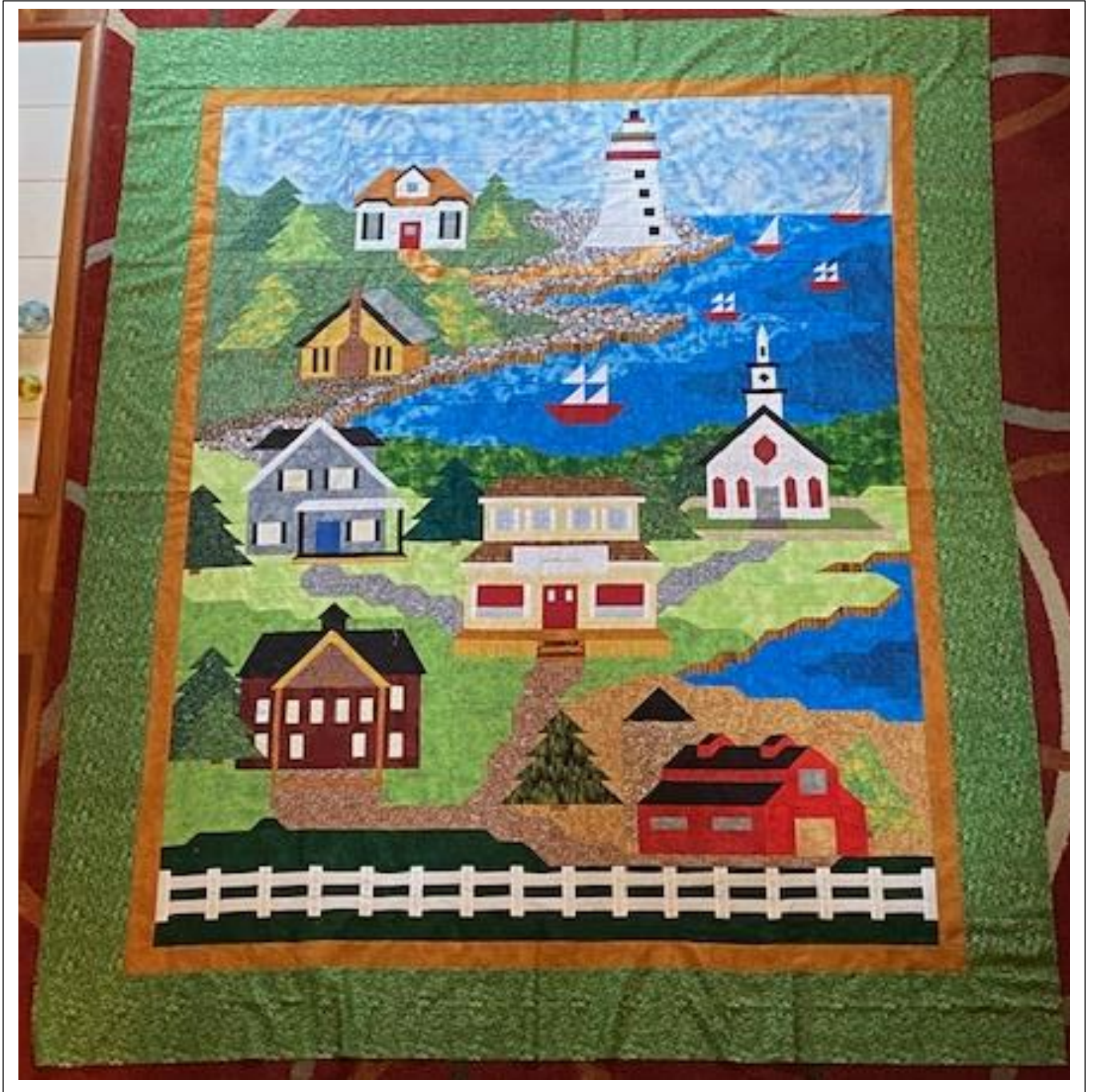
Final Quilt Top for All Roads Lead to the Sea