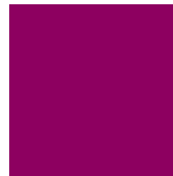
MAGENTA 11 x 20