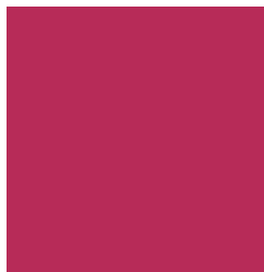
ROSY POSEY 12 x 14