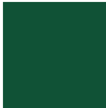
Pine 6 X 21