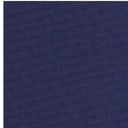
BLUE 2 14 X 14