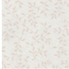
BACKGROUND 14 X 14