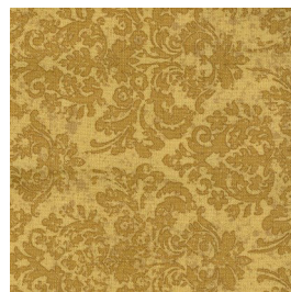
YELLOW 1 12 X 14