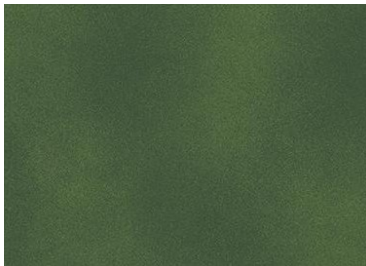
Green 4: Dark Green—Scallop circles