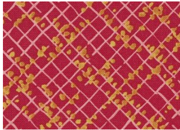
Red 1: Blotted Graph Paper Poppy—Flowers