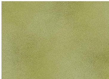
Green 2: Dark Sage—Leaves, scallop circles