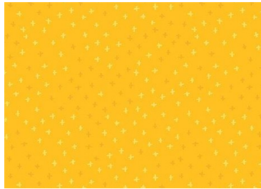
Yellow 1: Positivity Mustard—Flowers