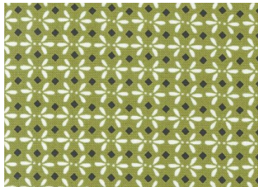
Green 3: Snow Angels Pine—Leaves, scallop circles