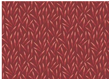
Red 3: Bean Crimson - Flowers