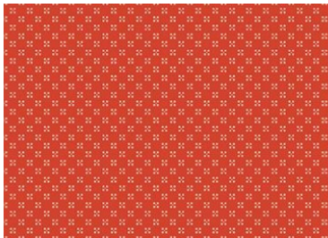
Red 1 Sub: Dots Red - Flowers