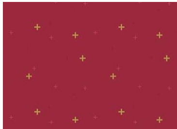
Red 2: Redwood Sparkle—Flowers