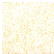
BACKGROUND 8 1/2 x 40