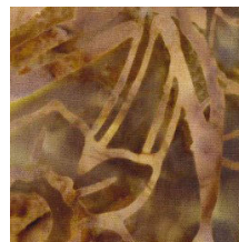
FABRIC #13 4 1/2 x 40

The original fabrics in the pattern are no longer available. We are using a variety of batik fabrics and we will try to choose fabrics close to those pictured in the pattern. The fabrics will not be the same each month so you will need to go by the fabric key. Some fabrics may be similar to the one pictured.