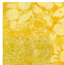
FABRIC #6 3 1/2 x 40