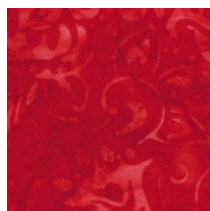
FABRIC #4 5 1/2 x 40