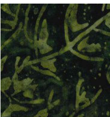
FABRIC #16 2 1/2 x 10

The original fabrics in the pattern are no longer available. We are using a variety of batik fabrics and we will try to choose fabrics close to those pictured in the pattern. The fabrics will not be the same each month so you will need to go by the fabric key. Some fabrics may be different but similar to the one pictured.