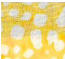
FABRIC #6 4 x 20