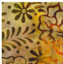
FABRIC #15 3 x 10