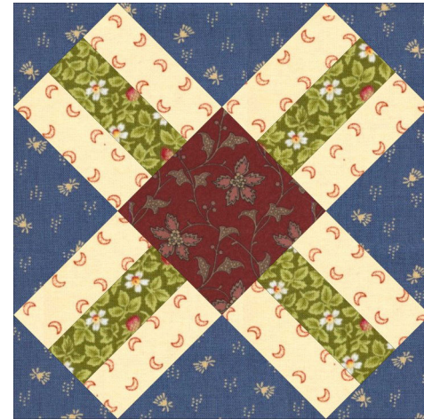
KENTUCKY CROSSROADS Block #39