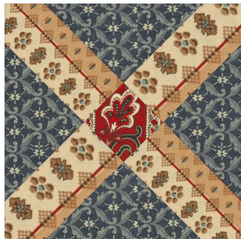
RAILROAD CROSSING Block #38