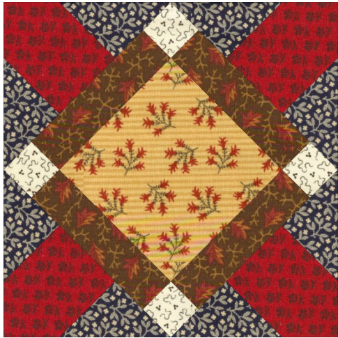
FORT SUMTER Block #37