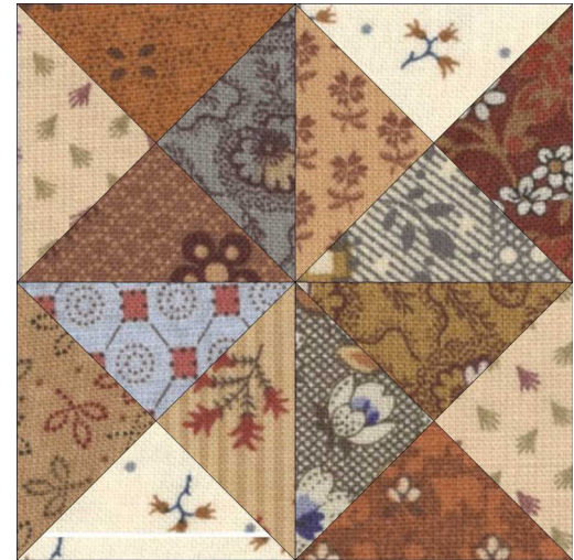
YANKEE PUZZLE Block #10