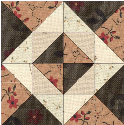
BLOCKADE Block #11