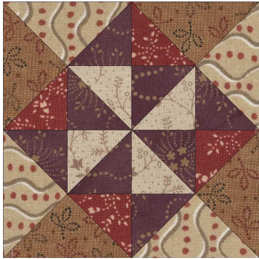
PEACE & PLENTY Block #9