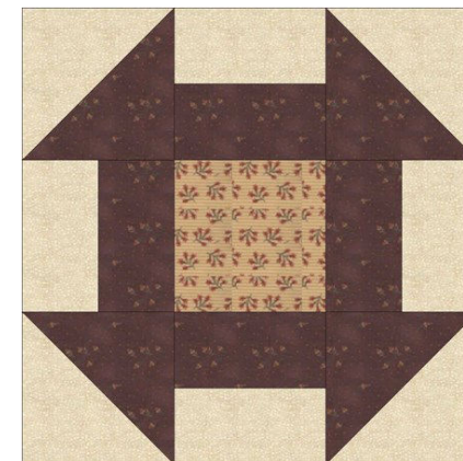
LINCOLN'S PLATFORM BLOCK #20