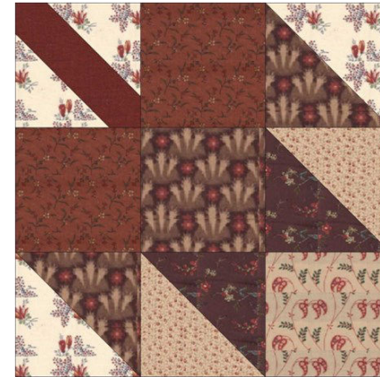
TEA LEAF BLOCK #18