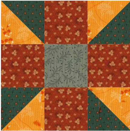
BLOCK #17 CALICO PUZZLE