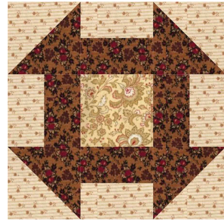
BLOCK #20 LINCOLN'S PLATFORM