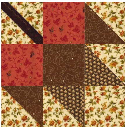
BLOCK #18 TEA LEAF