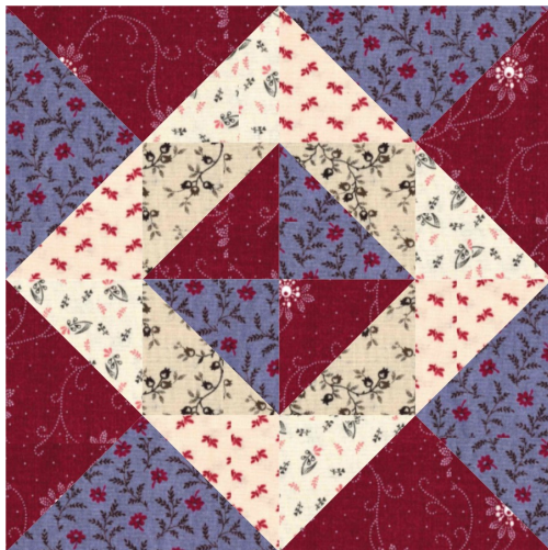
BLOCKADE Block #11