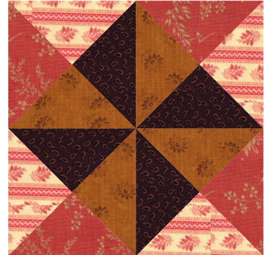
YANKEE PUZZLE Block #10