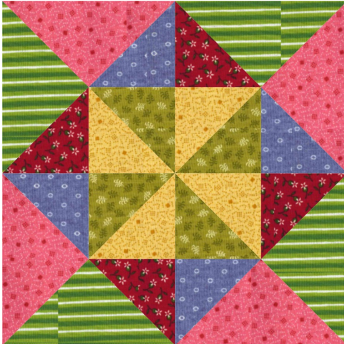
PEACE & PLENTY Block #9