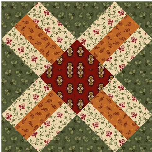
RAILROAD CROSSING Block #38