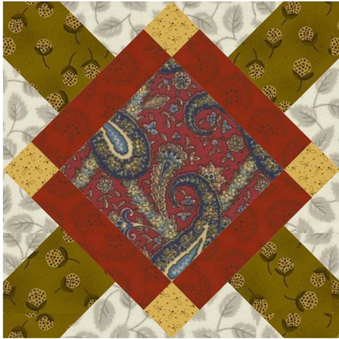
FORT SUMTER Block #37