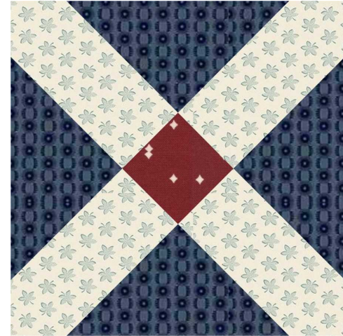
KENTUCKY CROSSROADS Block #39