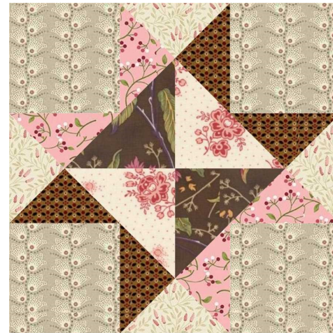
RIGHT HAND OF FRIENDSHIP BLOCK #36