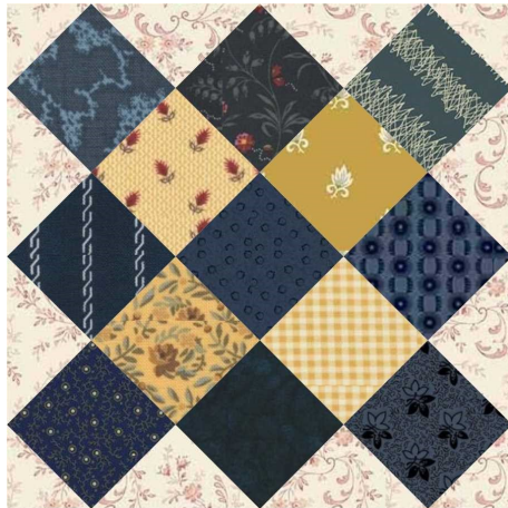
COURTHOUSE SQUARE BLOCK #35