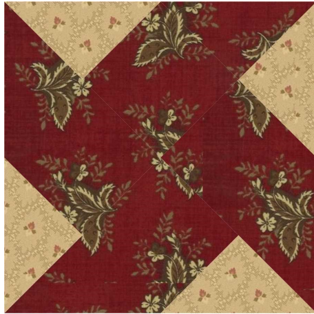
TWIN SISTERS BLOCK #33