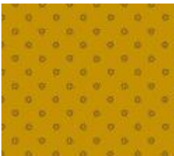
Gold 5 x 14