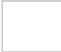
White 5 x 7