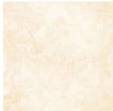
Off-white # 1 Background 18 x 10.5