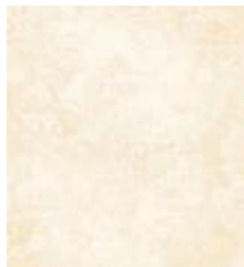
Off-white # 1 Border