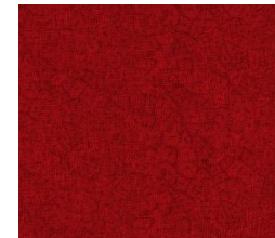
Red 9 x 7