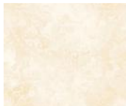
Off-white # 2 Background of Center Block 8 x 10