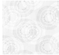
Low Vol- ume 7 X 4