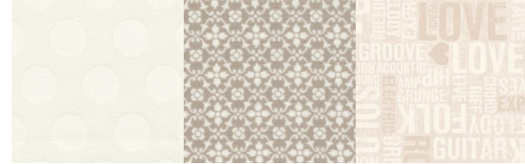
Low Volume 4 X 10