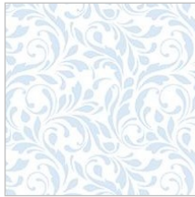
Low Volume C 7 x 4