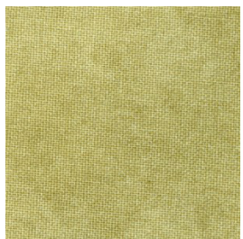
B, C, F, G, H 15 X 40