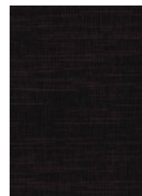
ROOF 12 X 42