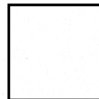
BACK GROUND 23 X 42