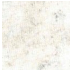
#5 7 x 42