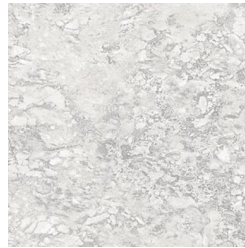
#2 30 x 42