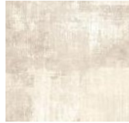
9 x 21 Fabric # 1