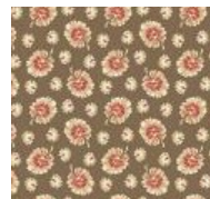
16 x 7 Fabric # 5