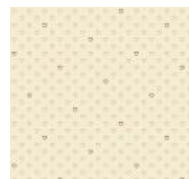
8 x 21 Fabric # 2