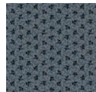
15 x 7 Fabric # 4