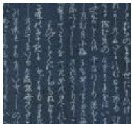
14 x 21 Fabric # 2