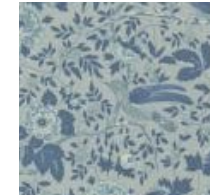
8 x 21 Fabric #3