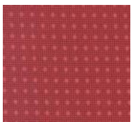
9 x 21 Fabric #3