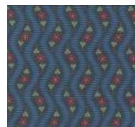
11 x 7 Fabric # 3