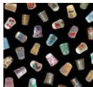
7 x 21 Fabric # 1