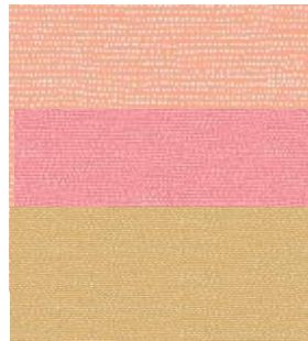
Backing 180 x 42