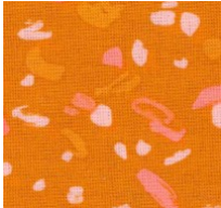
Beak and Feet