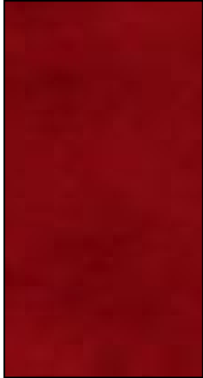
BORDER & BINDING 36 X 42