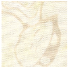
COMPASS BACKGROUND #2, 3, 6, 7