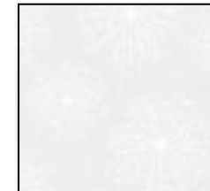
White 8 x 4