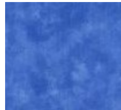
Blue 8 x 4