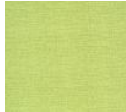
Green - 3 (Light) 8 x 21