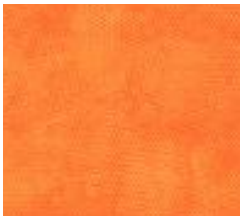
Orange 8 x 14