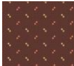
Brown 8 x 3