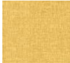
Gold 8 x 4