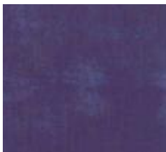
Purple 8 x 42