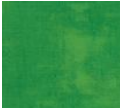
Green - 1 (medium) 20 x 42