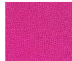
Pink 8 x 5