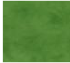
Green - 2 (medium) 8 x 14