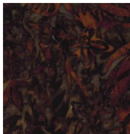
FABRIC #9 EVERGREEN