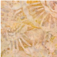
FABRIC #4 TOFFEE