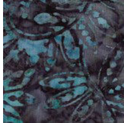
FABRIC #7 THUNDER