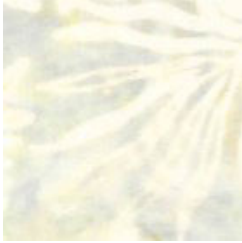
FABRIC #1 WHISPER