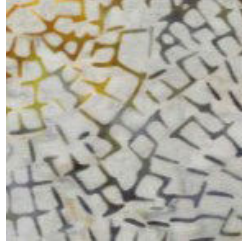
FABRIC #2 WINTER