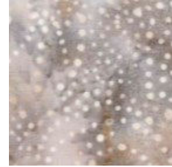
FABRIC #3 STONE