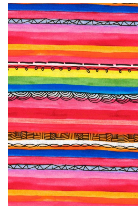
GREEN STRIPE 27 X 42