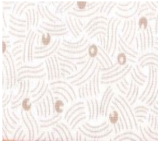
FABRIC # 1 BACK- GROUND