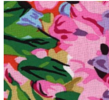
FABRIC # 14 11" X 10"