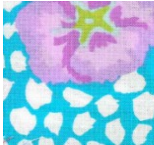
FABRIC # 9 8" X 7" LEAVE