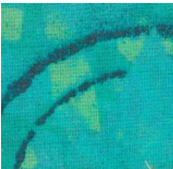
FABRIC # 7 6" X 6"