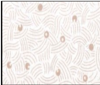
FABRIC # 1 BACKGROUND 12" X 20"