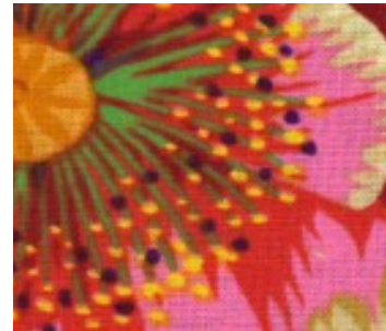
FABRIC # 14 10" X 10"