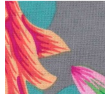
FABRIC # 14 7" X 7"