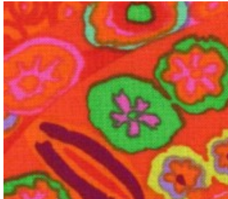
FABRIC # 2 7" X 4"