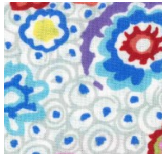
FABRIC # 11 8" X 7" LEAVE