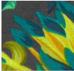
FABRIC # 6 9" X 8"