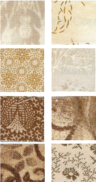
E, F, G 8 ASSORTED