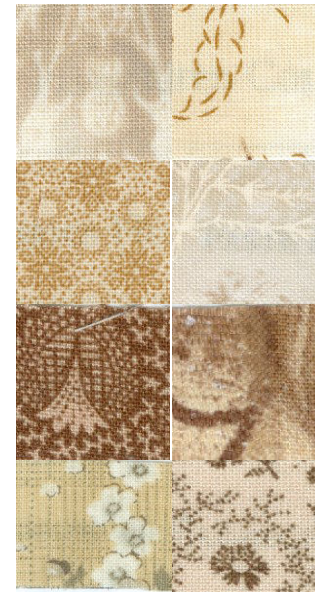
E, F, G 8 ASSORTED