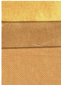
OHIO STAR POINTS