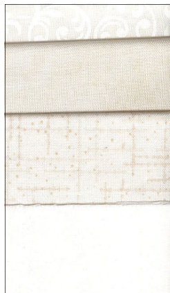
FLAGS BACKGROUNDS 1 THU 3 (32 X 4)