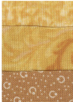
OHIO STAR CENTERS