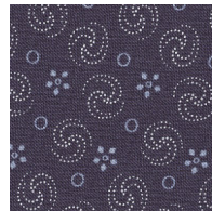
MD BLUE 1 Sub for 14824-15