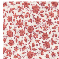
LT RED 1 Sub for 14813-22