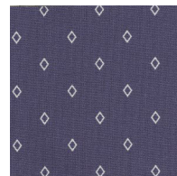
DK BLUE 2