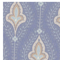
LT BLUE 1