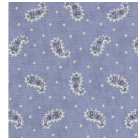
LT BLUE 4