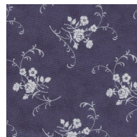
DARK BLUE 1