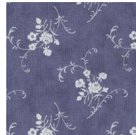
LT BLUE 5 (sub for 14825-14)