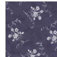
DK BLUE 1