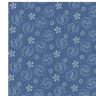
MD BLUE 2