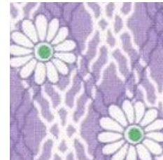
Fabric #7 10 X 21