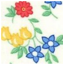
Fabric #3 10 X 21