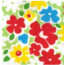
Fabric # 1 17 X 42