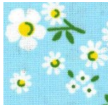
Fabric #4 10 X 21