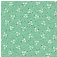
Fabric #9 7 X 21