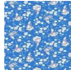
Fabric #17 7 X 21