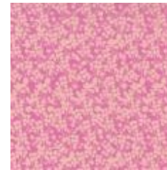
Fabric #19 9 X 21