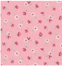
Fabric #6 9 X 21