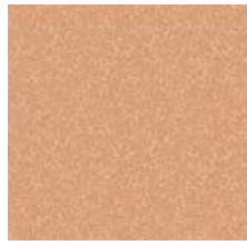
Fabric #11 7 X 21