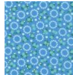
Fabric #21 7 X 21