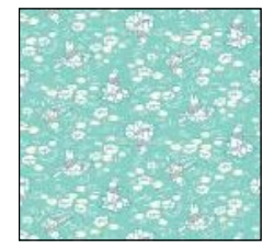
Fabric #18 7 X 21