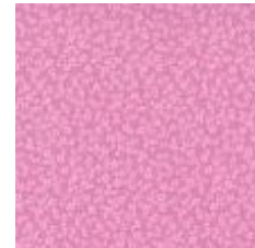
Fabric #12 13 X 21