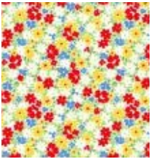
Fabric #1 7 X 21