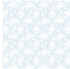
Fabric #8 9 X 21