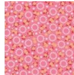
Fabric #26 9 X 21