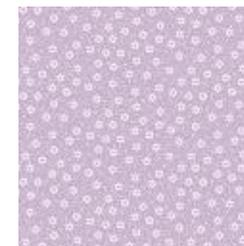
Fabric #10 7 X 21