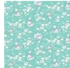
Fabric #18 9 X 21