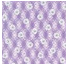
Fabric #7 9 X 21