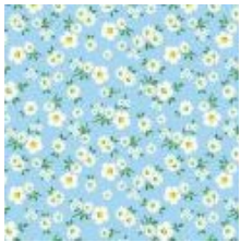
Fabric #4 9 X 21