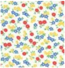
Fabric #3 9 X 21