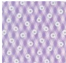
Fabric #7 16 X 7