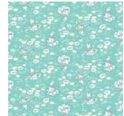
Fabric #18 16 X 7