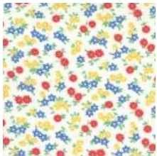
Fabric #3 10 X 21