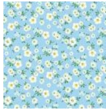
Fabric # 4 14 X 7